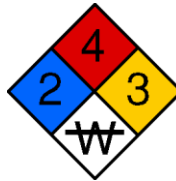
11" x 11" NFPA 704 Diamond Required in commercial/industrial buildings where chemicals are stored.